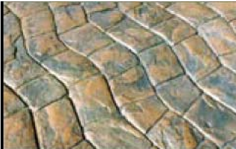
FM-1300 Serpentine Stone

A wavy pattern of slate tiles with a hand-chiseled look