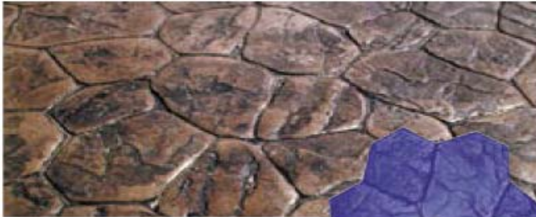
Random Stone, FM-700 29.125" x 29.125" (73.97 x 73.97 cm) Red, Yellow and Blue Heavily textured random fieldstones