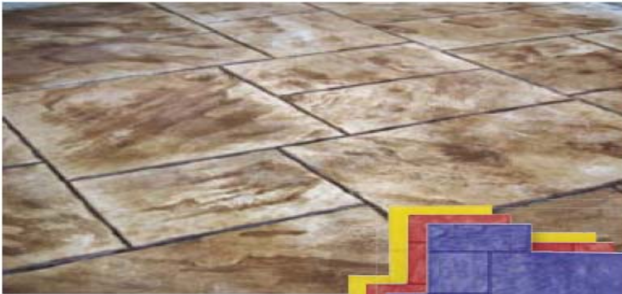
Regal Ashlar (Blue Stone) FM-3650 S/O 36" x 36" (91.44 x 91.44 cm) Red, Yellow, and Blue Blue stone textured tiles, with worn beveled edges, arranged in an ashlar pattern

Stone textured tiles with worn beveled edges, arranged in an Ashlar pattern