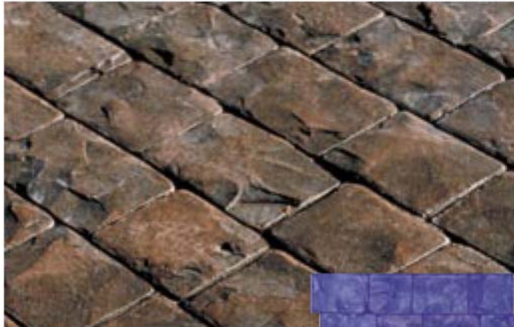
London Cobble, FM-540 S/O 17" x 29.75" (43.18 x 75.56 cm) Blue A traditional lightly textured cobblestone pattern

A staggered pattern of cobblestone with smooth joints and rounded edges